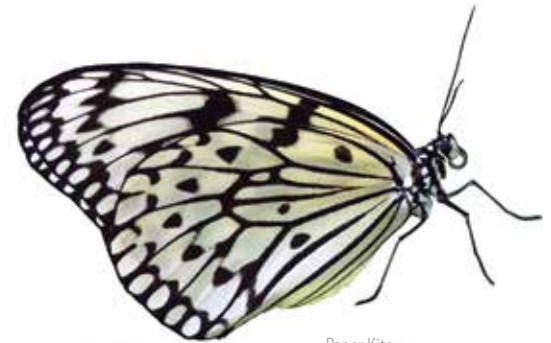
Paper Kite ( Idea leuconoe )

8 Hands Martial Arts LLC Agency Off Record BBBseed Blue Federal Credit Union Campbell Sports Inc. Children's Museum of Denver Community First Foundation / LMC Community Foundation, Arvada Conoco Phillips EcoMark Solar ExxonMobil Scotttrade Inc. Sylvan Learning Centers of Broomfield