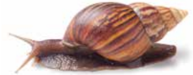
Brown Garden Snail ( Cornu aspersum )