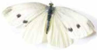
Cabbage White Butterfly ( Pieris rapae )

Butterfly Pavilion recognizes the importance of managing our natural resources today so we can ensure a wealth of biodiversity tomorrow. From caring for our residents within Butterfly Pavilion walls, to educating the public on the importance of protecting pollinators in our backyards and supporting fair trade around the world, our science, conservation and educational efforts are far reaching. Our educational programs connect our guests to this science and increase their understanding and appreciation of the world around them.