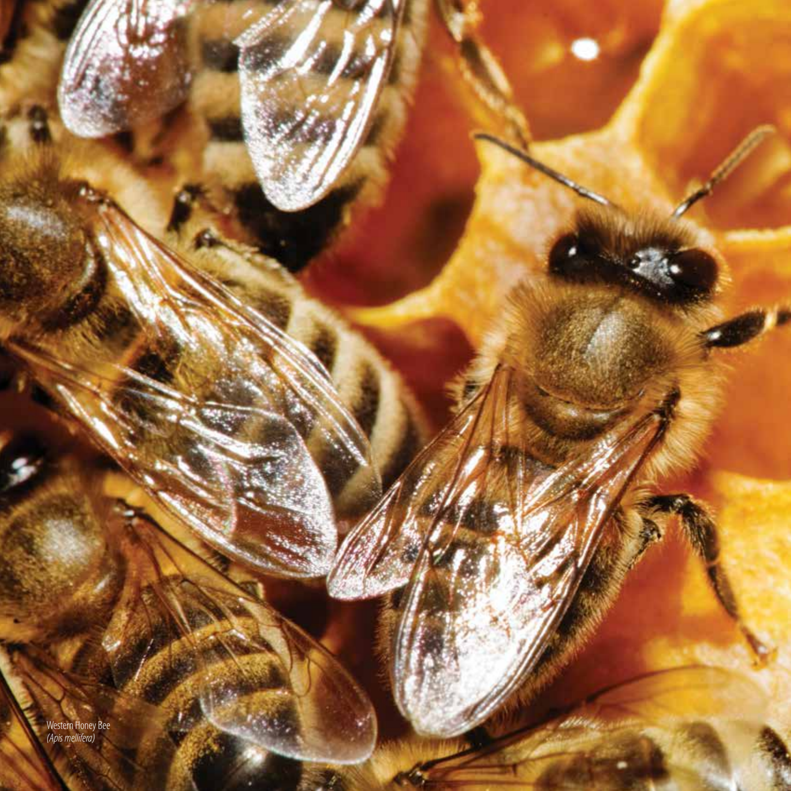
Western Honey Bee ( Apis mellifera )