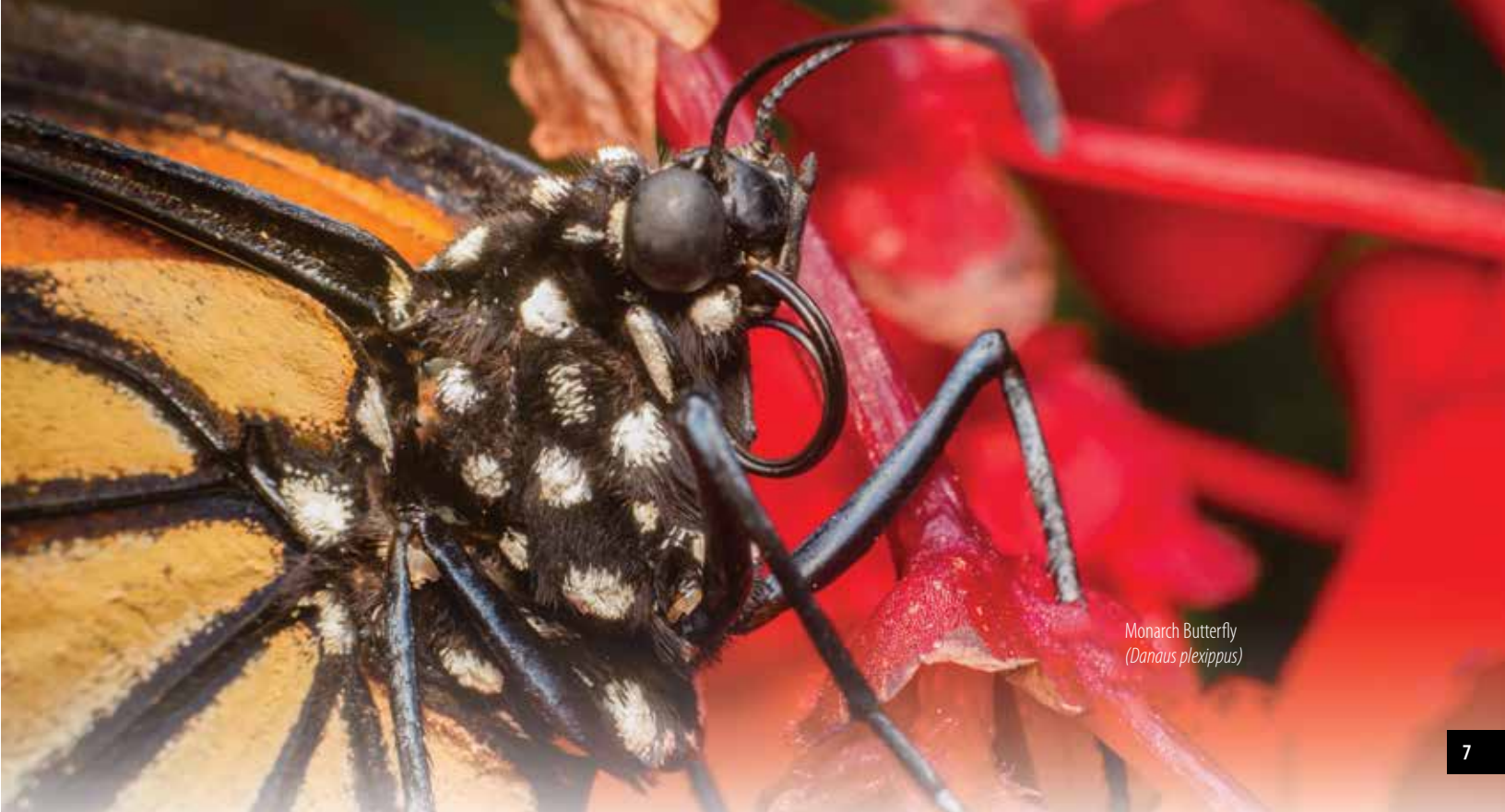
Monarch Butterfly ( Danaus plexippus )