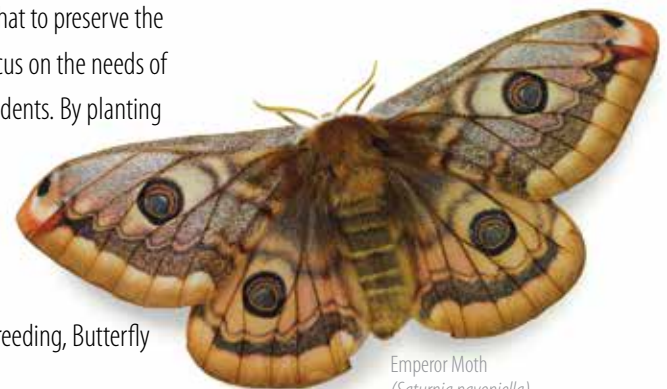
Emperor Moth ( Saturnia pavoniella )