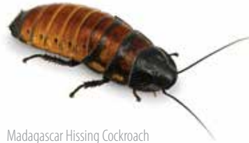
Madagascar Hissing Cockroach ( Gromphadorhina portentosa )