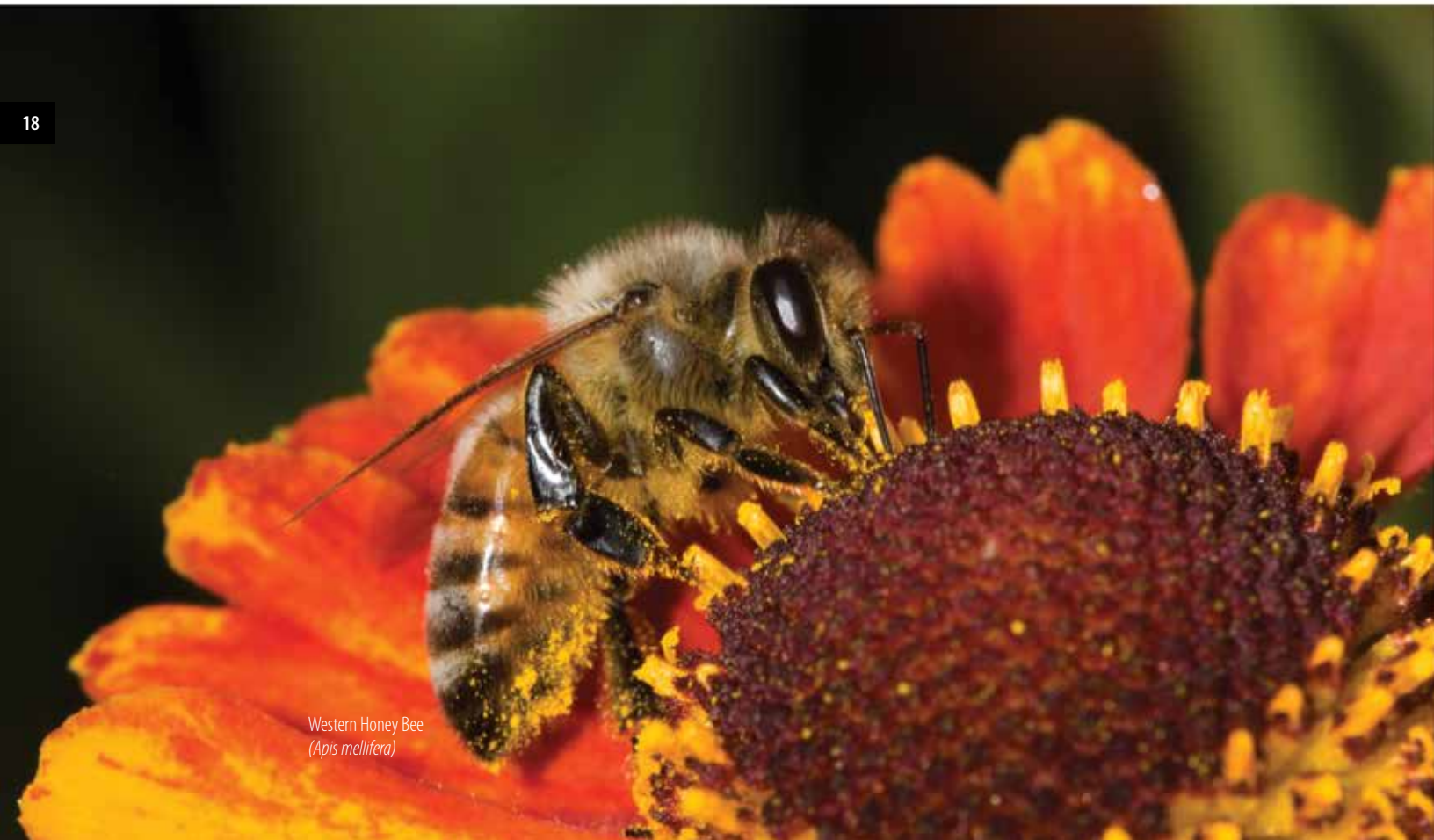
Western Honey Bee ( Apis mellifera )

chemical pollution. Through PACE, Butterfly Pavilion is emerging as a national leader in pollinator conservation. Our goal is to support 20 million pollinators by 2020, and we are making huge strides toward making that goal a reality. Under the PACE umbrella, Butterfly Pavilion takes a holistic approach to ensure our success through a variety of programs, including the following: