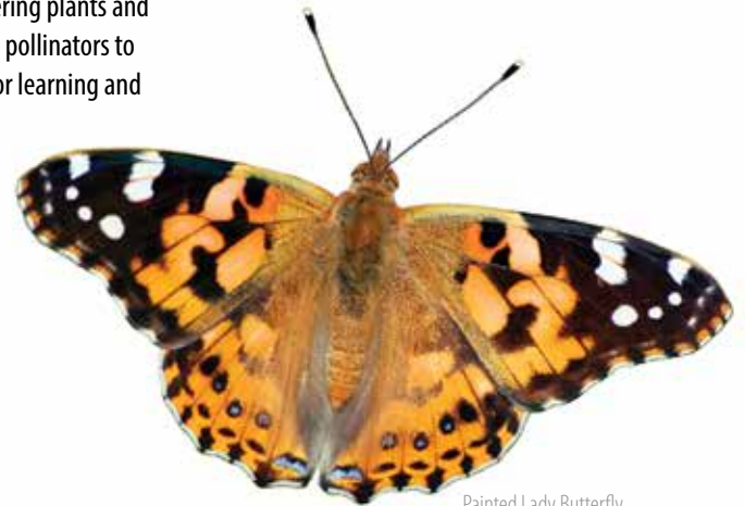
Painted Lady Butterfly ( Vanessa cardui )

Our award winning programs and classes offer guests, young and old, unique and exciting ways to learn. Programs for young learners strive to create and inspire future land stewards, scientists and conservationists. Our adult programs offer a level of engagement that ignites a passion for conservation.