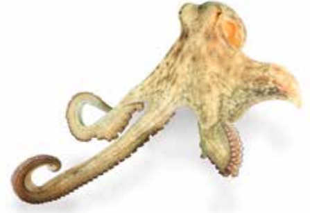
Common Octopus ( Octopus vulgaris )