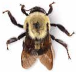
Eastern Bumble Bee ( Bombus impatiens )