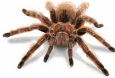
Chilean Rose Hair Tarantula ( Grammostola rosea )